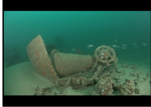
A machine gun base on the seabed